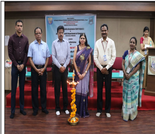
Inauguration of the workshop