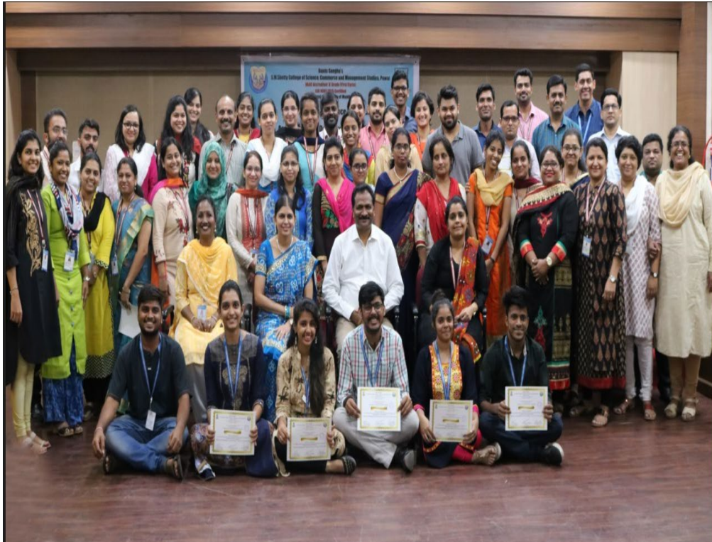
PARTICIPANTS AND VOLUNTEERS OF THE SESSION