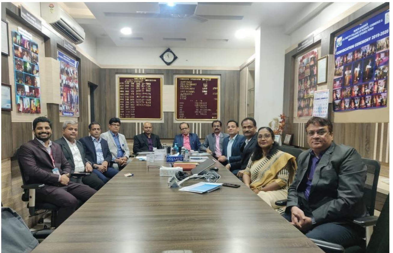
Powai Education Committee Meetings