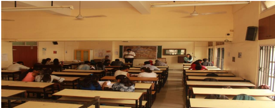
Crossword in progress