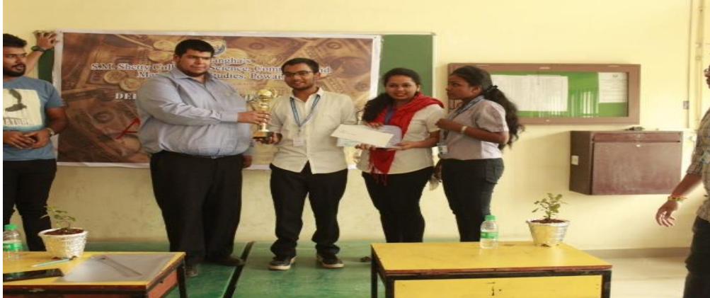
Felicitation of winners