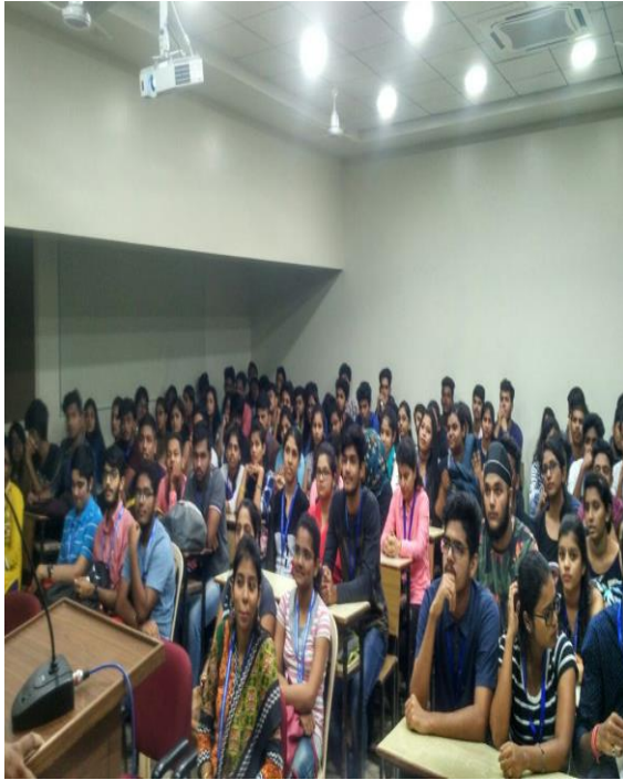
Enthusiastic students participants