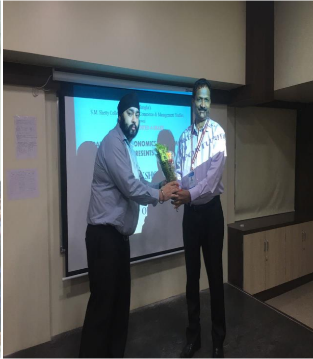
Felicitation by Principal