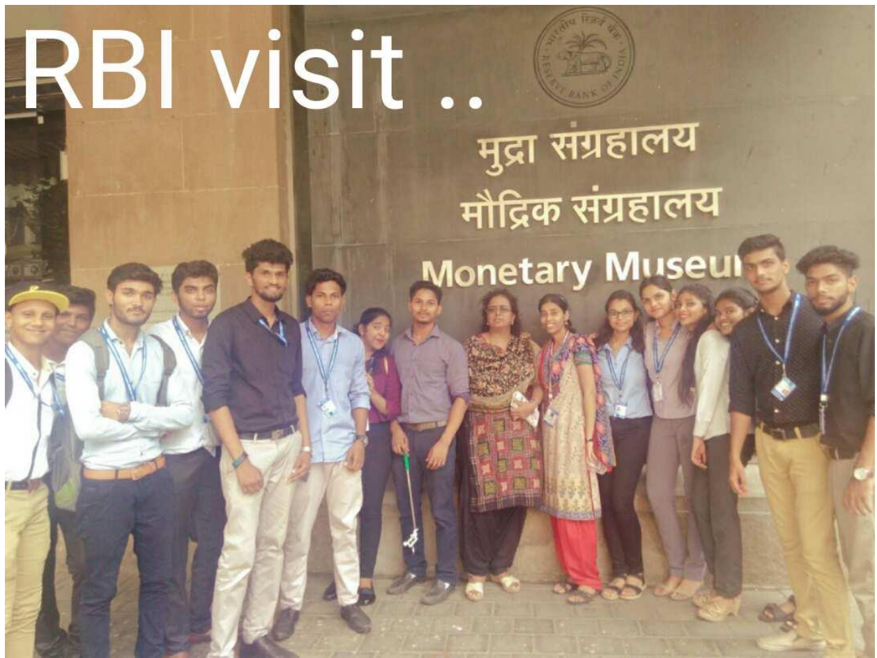
Students and teachers at the venue

BUNTS SANGHA'S S.M. SHETTY COLLEGE OF SCIENCE, COMMERCE AND MANAGEMENT STUDIES, POWAI NAAC ACCREDITED 'A' GRADE ISO 9001:2015 CERTIFIED