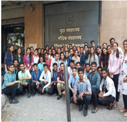
Students at RBI