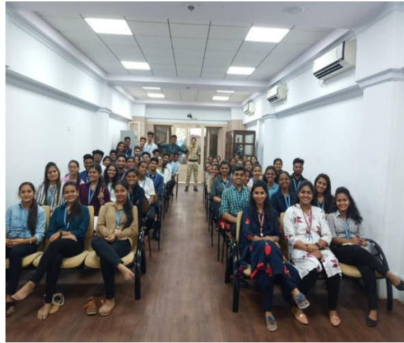
Student attending the session at RBI