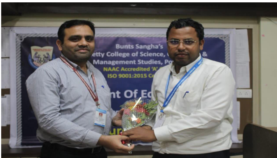
Felicitation of the resource person