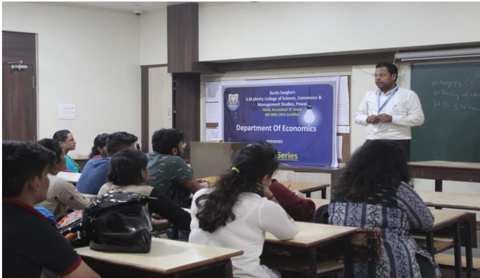
The session in progress