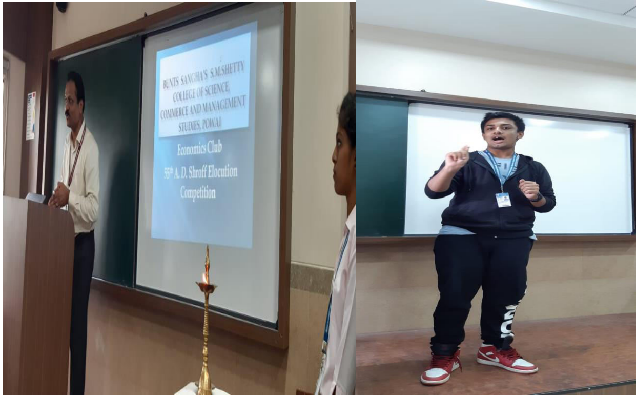
Principal's inaugural address