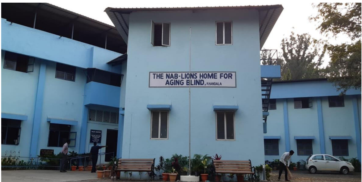
National Blind Association, Lonavala