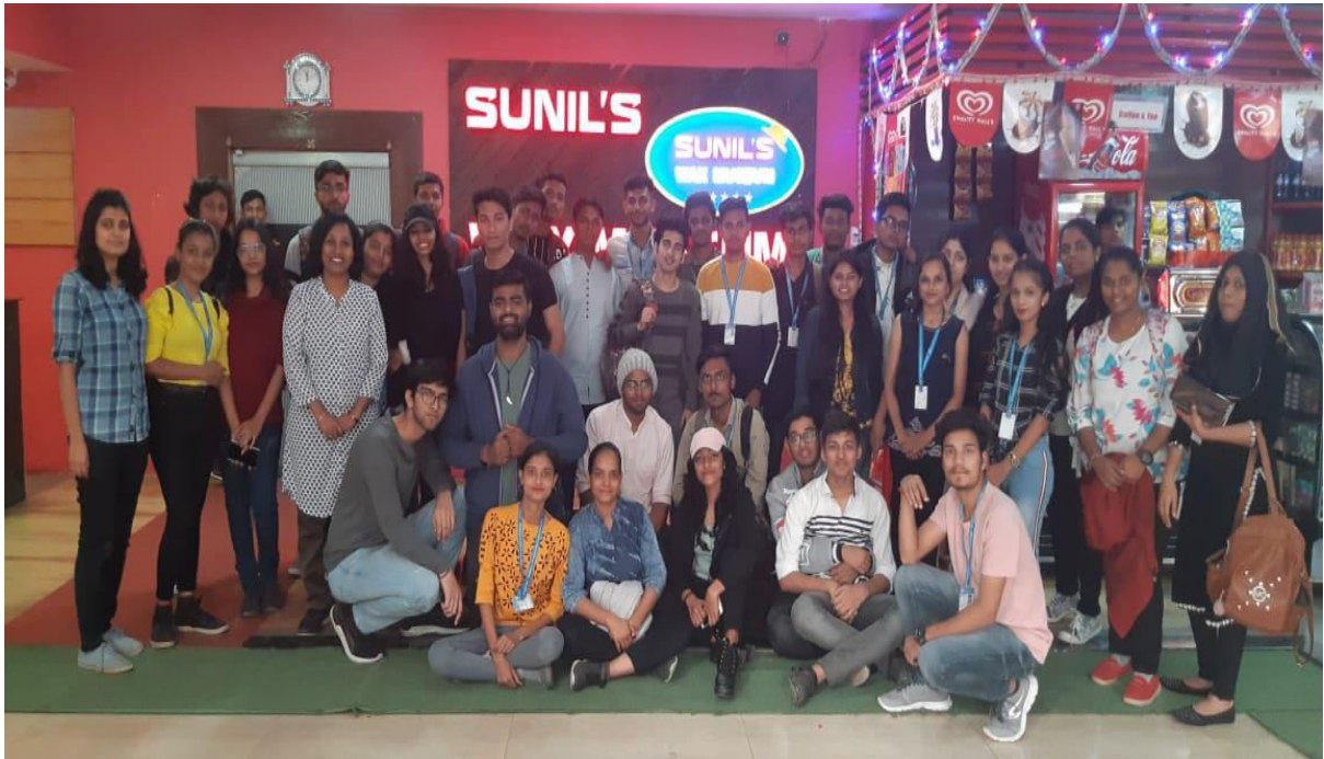
At Sunil's Wax Museum