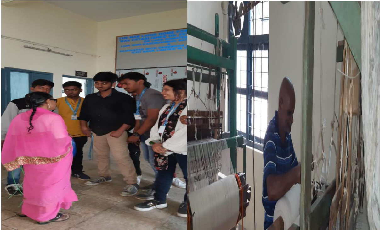
National Blind Association, Lonavala- Students interaction with inmates of blind home.