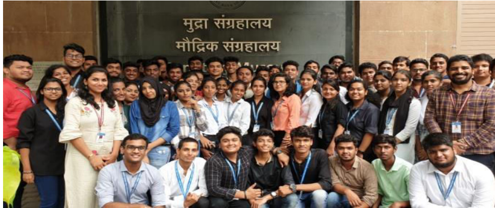
Students and teachers at RBI