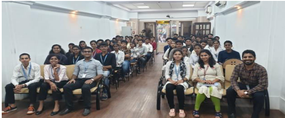
Sessions at RBI