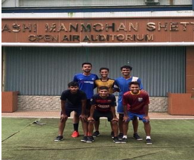
FOOTBALL BOYS 1ST PLACE SPORTS WEEK 2019 - 2020