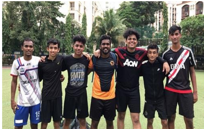
FOOTBALL BOYS 2ND PLACE SPORTS WEEK 2019 - 2020