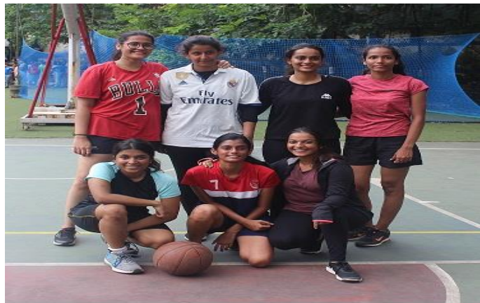
BASKETBALL GIRLS 1ST PLACE SPORTS WEEK 2019 - 2020